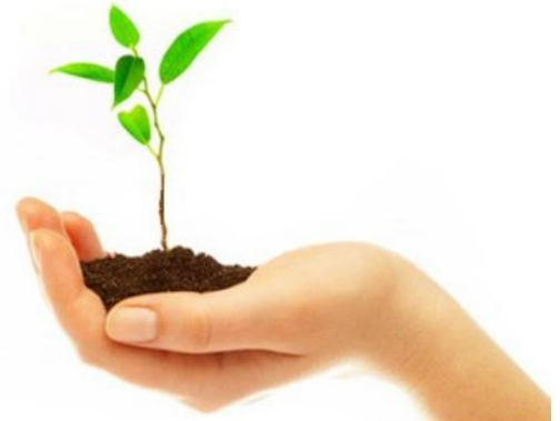
Hephatha Lutheran CHILDREN'S CHURCH